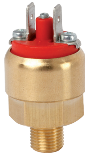
OEM compact pressure switch, miniature format, brass design, model PSM05